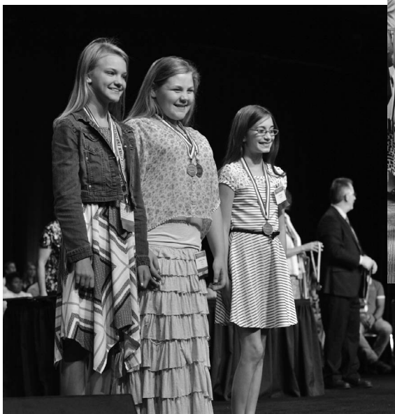
Just a sampling of Arkansas' young talent.