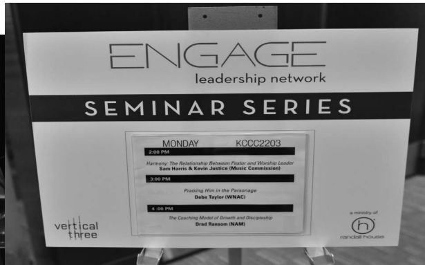
Did anyone check out that middle seminar?