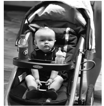
"Okay, where's the business meeting?"