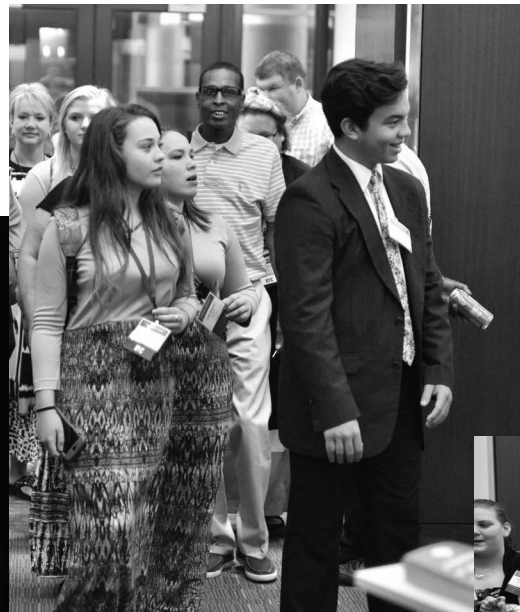
Wow! Are these some of the same kids who spent three weeks at Camp Beaverfork?!