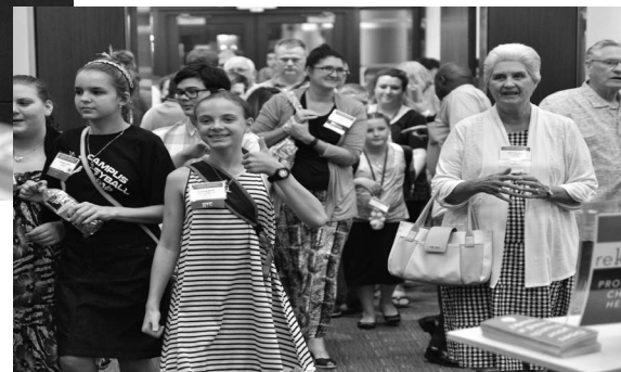
More Arkansans headed to the exhibits!